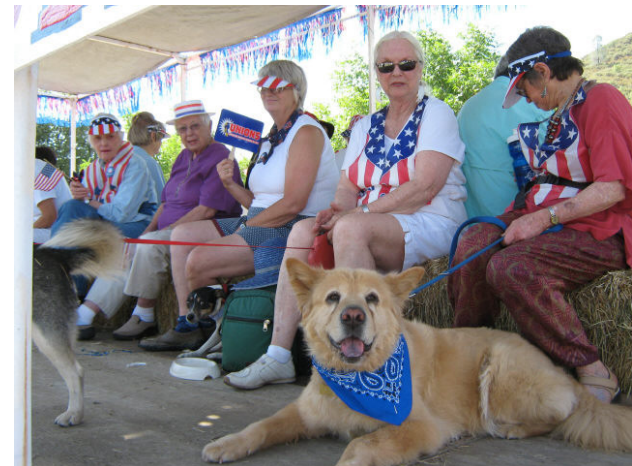
Scene from the 2008 Mariposa Democratic Club Float